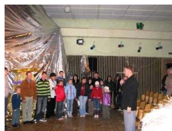
Drama in the Vabalninkas city, Lithuania, where Birzai's Pentecostal Church is starting with new children work and church. Despite of resistance of catholic many people responded to the altar call.

Years ago while I was watching soccer game, God showed me a picture from church – the Body of Christ as a soccer team. Soccer is a team game, there might be some stars in the team, but this alone doesn't help. Every man has to give himself into this game, then and only then this team can win.