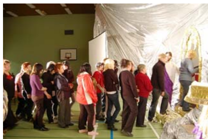
People, who accepted Jesus Christ as their Saviour in Ylistaro, Finland going through the Heaven’s gate – this place is opened even for You Today...

We thank you for your prayers, so we can take our “horse”, which takes us from one place to another, to exchange it. Our 10-years old Fiat Ducato has been serving us very faithfully, but unfortunately 380 000 km on different roads and especially with the trailer have exhausted it.