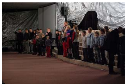
Altar call in Tartu, Estonia, where we saw over 100 people on altar during 3 nights. Many pastors from other cities in South-Estonia came there with their youth and helped them to go to the altar.

This is our bread – seeing people on altar – it gives new strength to keep on going against next challenges, which are waiting for us.