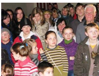
People responding to the altar call in Mazeikiai, Lithuania. Youth and old people altogether. Also many children from orphanage gave their lives to God – now they have Father, who loves them.

I would like to share some thoughts with you, which have risen to my heart and testimonies from spring 2009. In spring we, Reality Outreach Ministries Baltic team, had altogether 5 live dramas in 4 different countries – Estonia, Finland, Latvia and Lithuania. We also had 3 video dramas in Latvia and Estonia. More than 2000 people came to see the drama and over 300 of them responded to the altar call and gave their lives to God during these drama crusades. We are thankful to each and every church, who called us to preach gospel. We are also thankful to every actor/actress, helper, who gave their time to participate. Great thanks to those, who have prayed and supported financially this ministry.