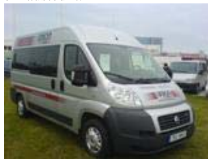
On background our old car and in foreground newer and proper version for us, which is on sale. Year 2007, thoroughfare 27000 km. Fiat Ducato. Cost of this car is about 19000 EUR at the moment.

Thank you once again for your prayers and support – we couldn’t go anywhere without that! Together with you,