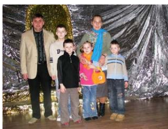
In Bauska, Latvia children from orphanage also responded to altar call. Many of them had seeing and hearing problems. Let's believe and ask God's healing power to touch them.