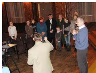
Video drama in the village of Vandzene, in Latvia, close to Talsi city. This village was strongly connected with occultism – still our God is greater - people came to the altar!